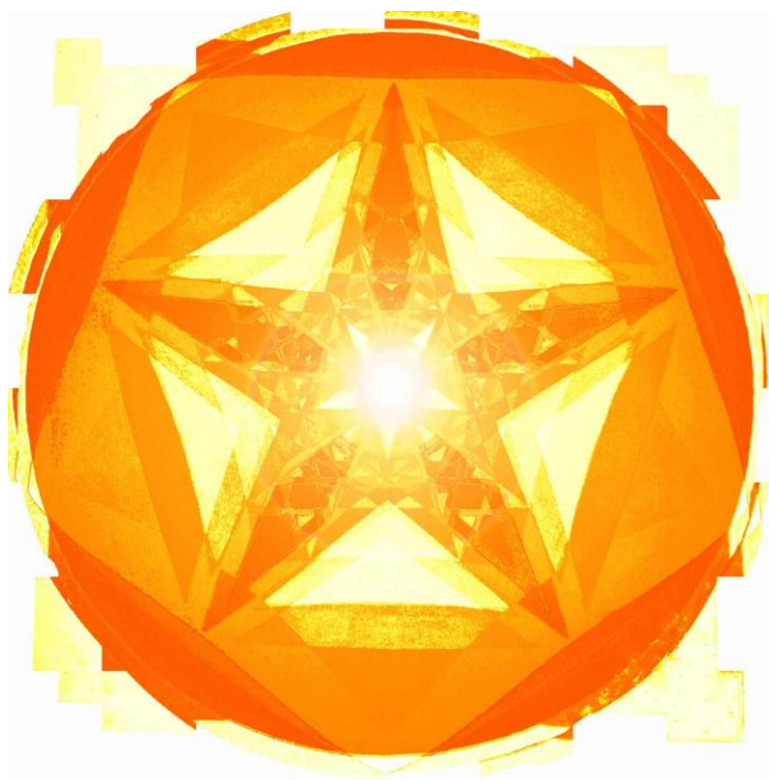
Ascension Codes By Vera Le Doux